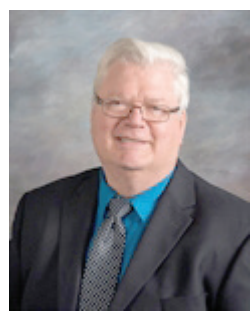
Richard Selzer Columnist

When I was a kid, my father was a do-it-yourself man who didn't always follow standard procedures. When he remodeled our bathroom, for example, he installed a bathtub that drained down the hillside instead of into the sewer or septic, and he didn't install a P trap (that bendy pipe under sinks and tubs where water gets trapped – and if you're lucky, where valuable jewelry ends up when it goes down the drain).