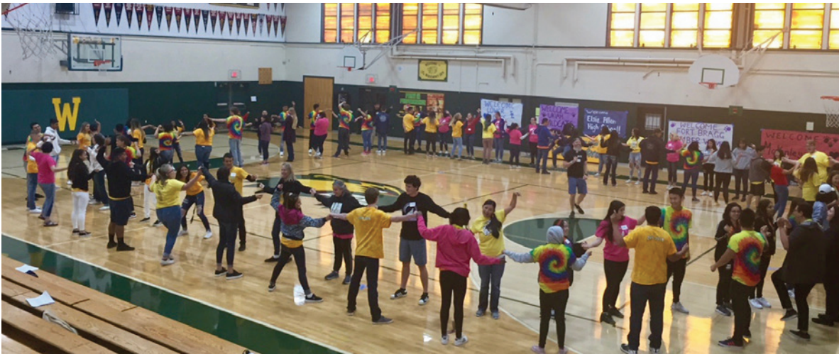
Students hold hands in the gym during a Link Leadership Conference hosted by Willits High School.