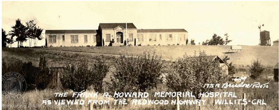
Above: This photograph postcard of Frank R. Howard Memorial Hospital is from around 1928.