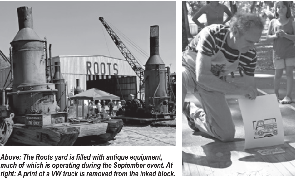
Above: The Roots yard is filled with antique equipment, much of which is operating during the September event. At right: A print of a VW truck is removed from the inked block.

SCHEDULE FOR SATURDAY, SEPTEMBER 10 SCHEDULE FOR SUNDAY, SEPTEMBER 11