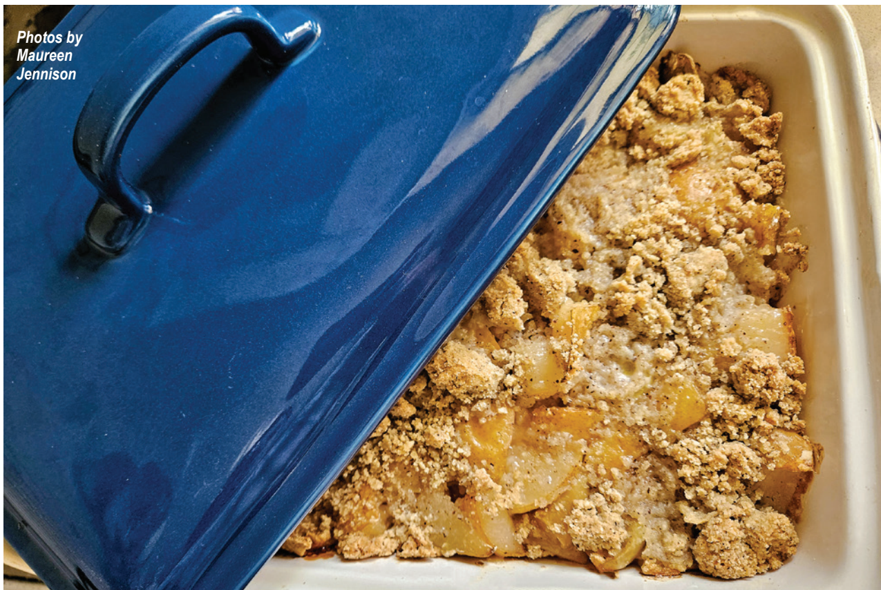
Pear crumble, right out of the oven (above) is the best served with a splash of cream (below).

Read the rest of Response Over on Page 11